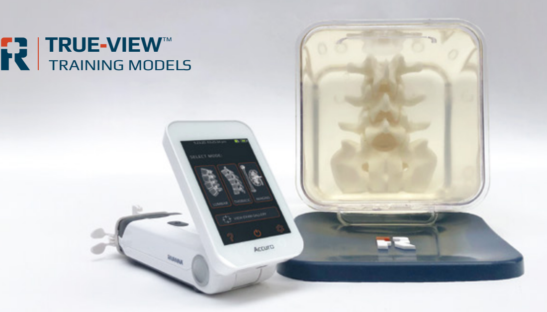
KEEP TRUE-VIEW STATIONARY FOR UPRIGHT IMAGING WITH PRO-GRIP LID